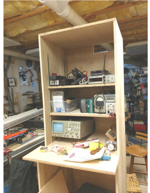
K4ELI's new test center